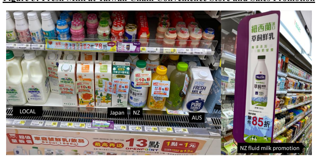
Figure 5: Fresh Milk at Taiwan Chain Convenience Store and Sales Promotion